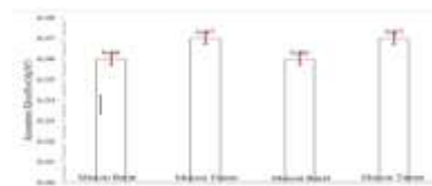
Figure 1. Average value of chlorophyll-a concentration pentury algorithm in Birah-birahan Island waters for 2 years

Average value of chlorophyll-a concentration pentury algorithm in Birah-birahan Island waters can be seen in Figure 1.