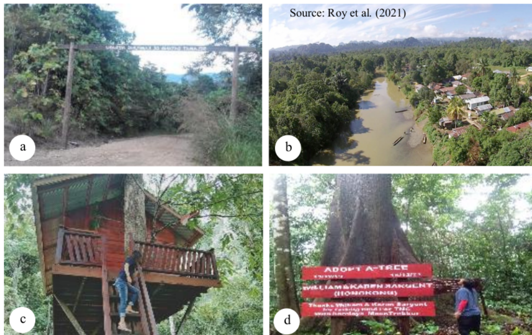
Fig. 3. Potential supports of Nya'deng Lake tourist objects and attractions: (a) the road to Merabu Village, (b) Lesan River, (c) treehouse, and (d) adopt a tree.

There is a treehouse with two bedrooms that visitors can rent ( Fig. 3c ). Accommodation for the number of rooms within a radius of 15 km. There are homestays or houses in the village that can accommodate several people. There is also lodging that has three rooms managed by Kerima Puri. Kerima Puri is the Village Forest Management Agency which also manages the