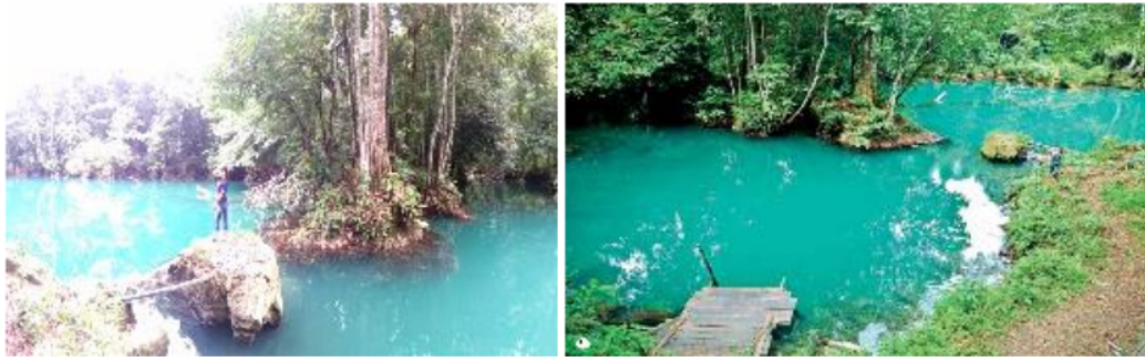
Fig. 2. Nya'deng Lake shows blue water surrounded by forest in Merabu Village.

The safety element fulfills four sub-elements: no dangerous currents in the lake, free from harmful plant disturbances, free from human interference, and free from disturbing beliefs. The variety of activities around the lake fulfills four sub-elements: canoeing, swimming, education and research, and enjoying the scenery. The peculiarities of the lake environment are flora, fauna, local cultural peculiarities, and historical value. The stability of the water in the lake met the sub-elements, which are: there is no lake water user industry, no reduction in land cover around the lake, rainfall throughout the year because it is a tropical rain forest area, and there is no erosion/landslide in the heavy category.